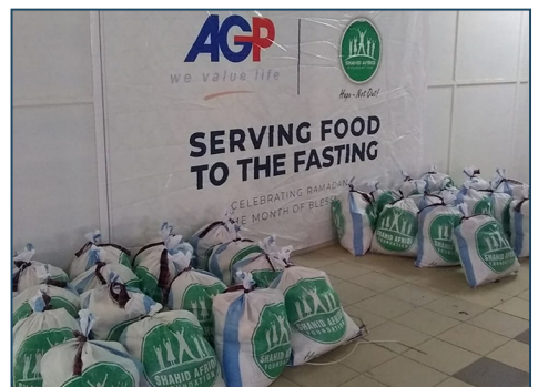
📍 Landhi town, Sindh