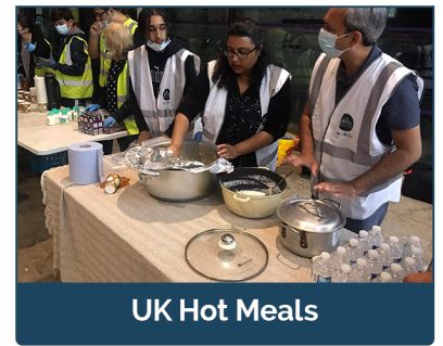
UK Hot Meals