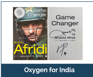
Oxygen for India