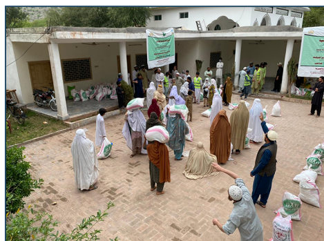
📍 Peshawar, KPK