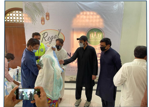
📍 Thatta desert, Sindh