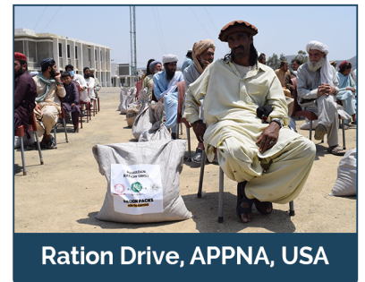
Ration Drive, APPNA, USA