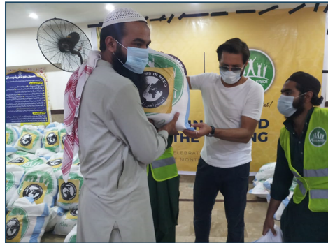
📍 Majeed colony, Sindh