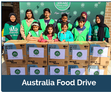
Australia Food Drive