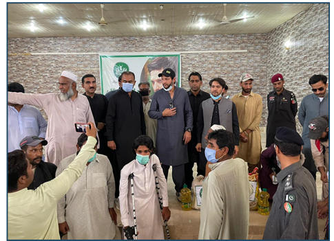
📍 Gawadar, Balochistan