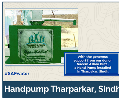
Handpump Tharpakar, Sindh