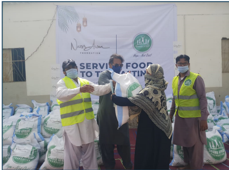
📍 Orangi town, Sindh