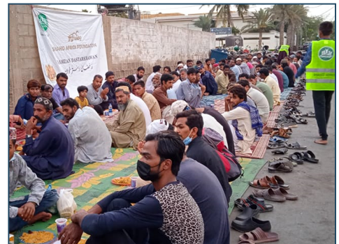
📍 Ramadan Dastarkhwan, Sindh