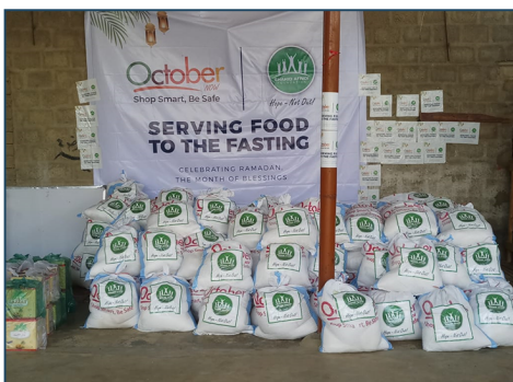
📍 Gadap town, Sindh