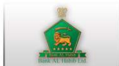
BANK AL HABIB LTD